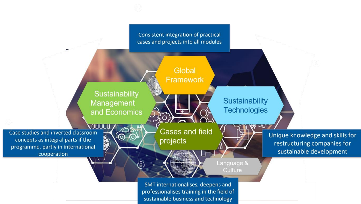
Figure 1.: Elements of the programme

Figure 1 summarizes some of the key elements of the study programme: sustainability management and economics combined with insights into technologies for a sustainable future within a global framework with a focus on practical application in the form of cases and field work. The programme's objective is to train personalities who manage technology-oriented businesses and organisations responsibly, to enable a sustainable development for people and the planet.